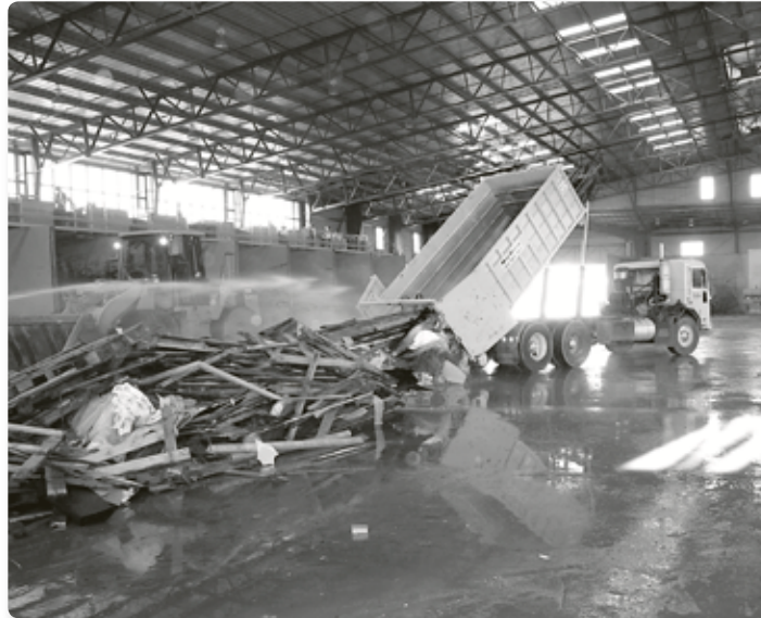
Construction and demolition waste at MarBorg's facility is sorted and recycled.

Noted Carlson, “We pull out every single nail, every bit of waste wood, or concrete, or drywall, and every scrap of PVC pipe, and recycle everything we can.” Approximately 80 percent of the construction waste is recycled overall. Much of the concrete and rubble is recycled for use in road base and other paving operations locally. Wood