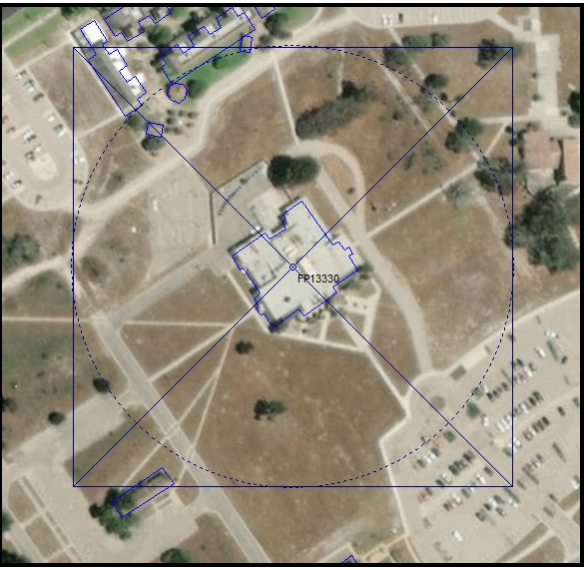
Table 1. Volume Sources Requiring Revision