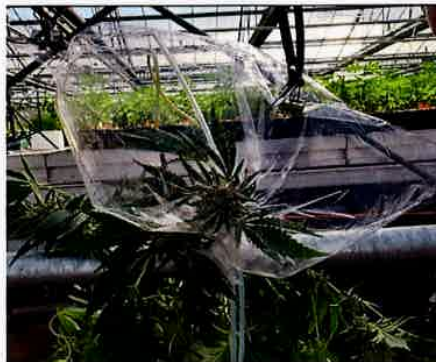
Figure 3. Example of leaf enclosure system used to develop emission factors.

potential impact on atmospheric distributions of specific biogenic volatile organic compounds (BVOCs). Although there are existing models available for estimating BVOC emissions from plants generally, the lack of emission factors for specific Cannabis strains limits accurate estimation of their emission rates. Therefore, the quantification of speciated emission factors is required to know the impact of a specific strain of Cannabis.