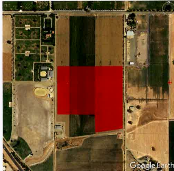
Figure 4. The location of the farm, modeled as an area source, shown as a red shade. Also shown the receptor where model predictions were made denoted by a red cross.

It was assumed that 10 acres of canopy will be spread over roughly 15 acres as shown in red shade in Figure 4. All model predictions were completed for August through October in 2016, 2017, and 2018 using observed meteorological data derived from Santa Ynez airport monitoring station resulting in 2,160 simulated hours. September and October are also the days with the lowest wind speed, and the highest chance for deposition. Figure 4 provides the location of the farm at 3800 Baseline Avenue Santa Ynez, CA 93460 that was modeled as an area source denoted in a red shade. The receptor location where 1,8-cineole, beta-myrcene, alpha-terpinene, and terpinolene concentrations were predicted is at 34°37'57.4"N 120°04'09.8"W (located approximately 700 feet downwind) and is shown in Figure 4 as a red cross.