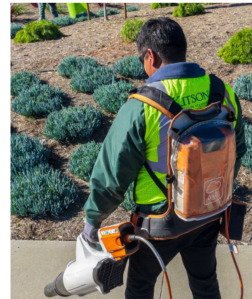
LEEF Participant, Kitson Landscape, with new blower and backpack battery