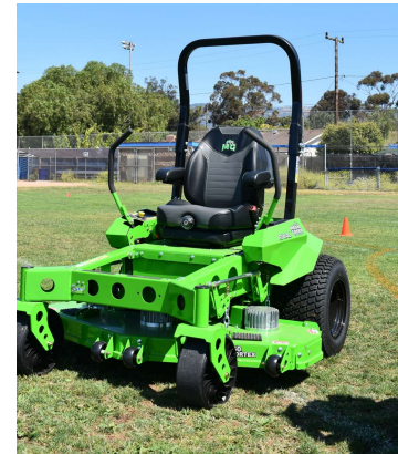
Mean Green Mowers electric mower