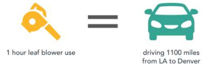
Ozone Precursor Emissions of Gasoline Equipment Use Compared to Passenger Car Travel