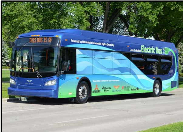
On-Road (potential - SBMTD)