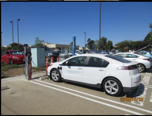
Allan Hancock College