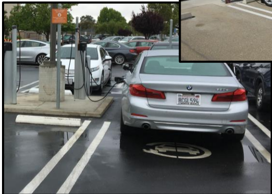
Marian Medical Center