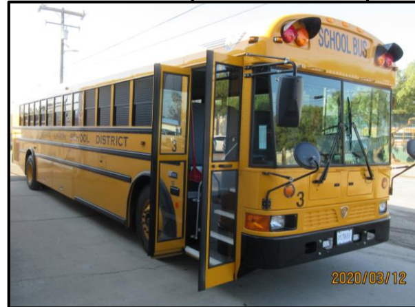
School Bus (Orcutt USD)