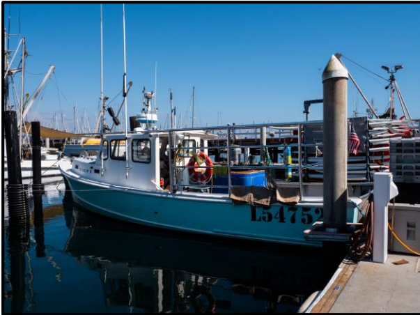
Marine (Goodland Seafood)