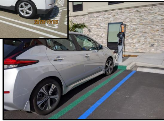
Hampton Inn (Santa Maria)