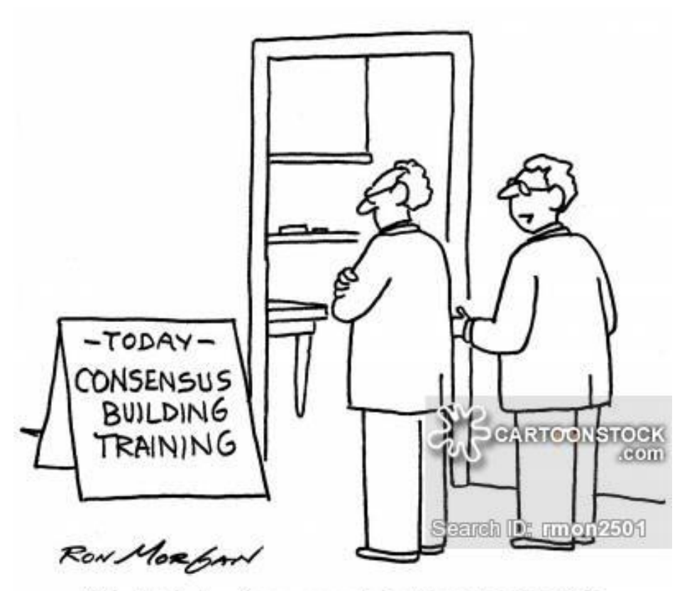
"That's just a fancy way of saying you agree with everything the boss says."